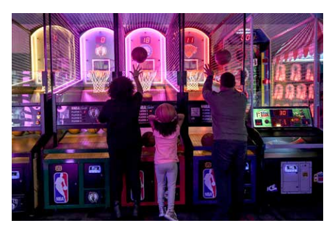
Basketball season has been over for Nets fans for a while, but family members get their fix in other ways.

BALL We have Nets tickets, and if there's a Sunday night game during basketball season, we'll go. It's usually a 6 p.m. game. We'll either go with the kids or invite some